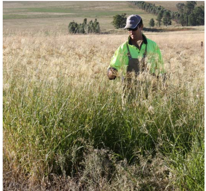
Competitive pasture trials, Wellington NSW

Cattle are most sensitive to these alkaloids, with sheep less affected and goats most tolerant. Goats can consume silverleaf nightshade as 25% of their daily dry matter intake without adverse affects.