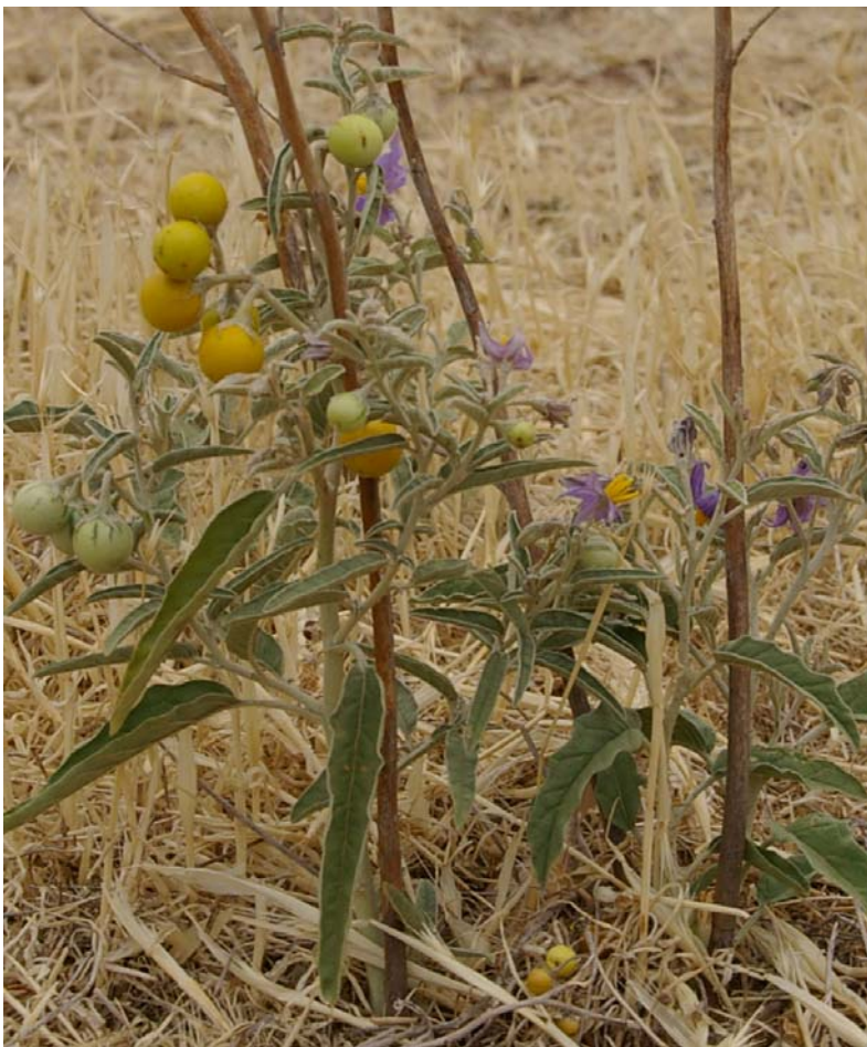
Silverleaf nightshade – photo courtesy of Rex Stanton, EH Graham Centre

Ensure all livestock do not have any berries attached to their coat or feet. If there is a chance the livestock have been grazing where berries were present, or consumed fodder containing berries, quarantine stock in a small area for 10-14 days to allow any ingested seed to be excreted.