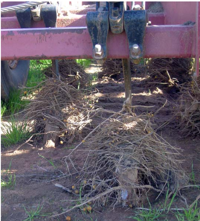
Silverleaf nightshade movement by cultivation – photo Rex Stanton, EH Graham Centre

Cattle and sheep will graze on silverleaf nightshade, particularly in the absence of more desirable pasture species. Silverleaf nightshade contains alkaloid glycosides, which may be hydrolyzed to form toxins that cause diarrhoea and nervous disorders, however no livestock deaths have been reported in Australia.