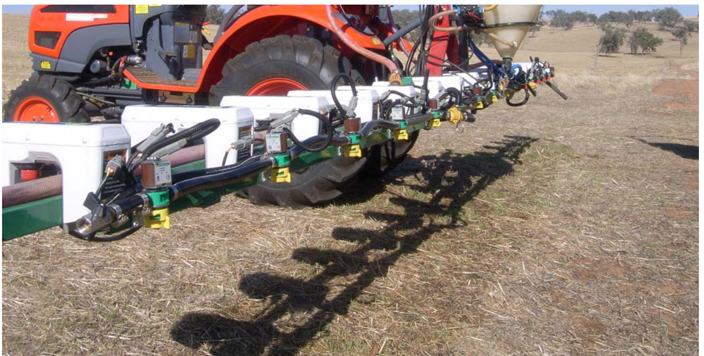
Weed activated spray boom – photo courtesy of Rex Stanton, EH Graham Centre

WeedSeeker booms operate by solenoids switching on whenever something green passes underneath the nozzle, therefore are best suited to fallow situations.